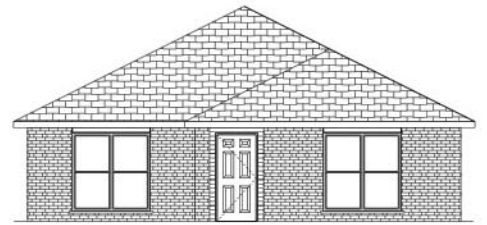
FRONT ELEVATION SCALE 1/8" = 1'-0"